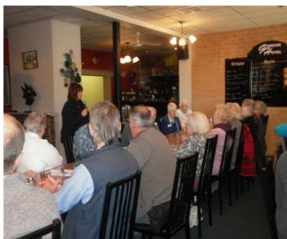
Guests at the luncheon

Many thanks to all the staff and volunteers who assisted us on that day.