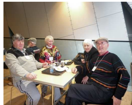
Melbourne Museum Bus Trip

The Coordinator continues to support the Multicultural Tucker program in preparing and assisting in coordinating the dining room. She also continues to support the Social Support Bus Trip that Centacare HACC program organises. The last bus trip we had was at the Melbourne Museum. Our next bus trip is on August 31 travelling to Gordon, Musk and Trentham.