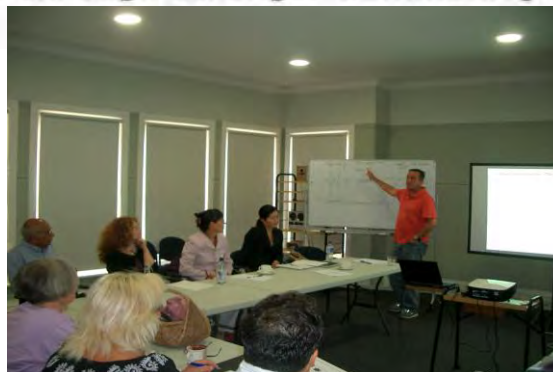
Above: Pictures of Board of Governance Training